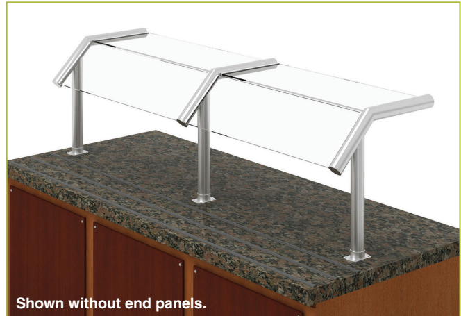
Shown without end panels.