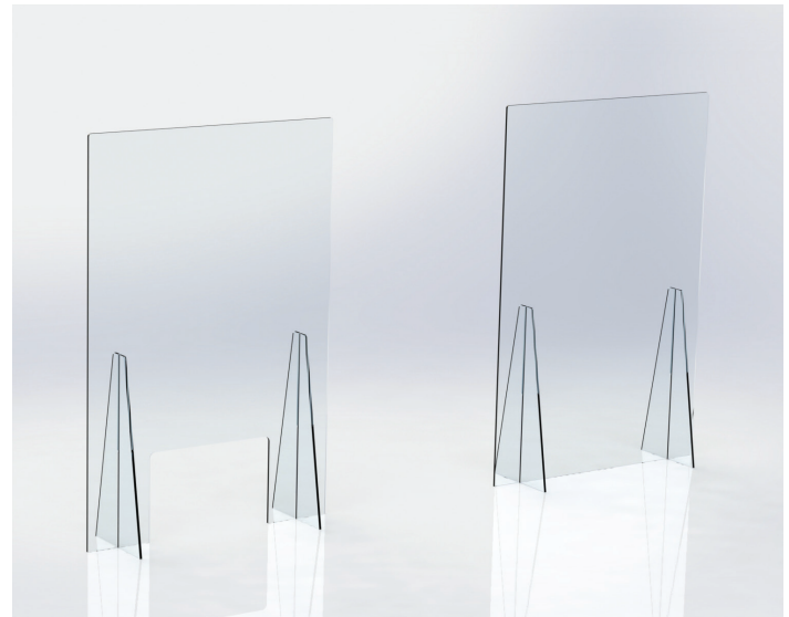
Left: BSI-PWPT (with pass thru) Right: BSI-PW (without pass thru)

* Bulk orders will be discounted for orders over 100 units. All units to be shipped to one location for full discount.